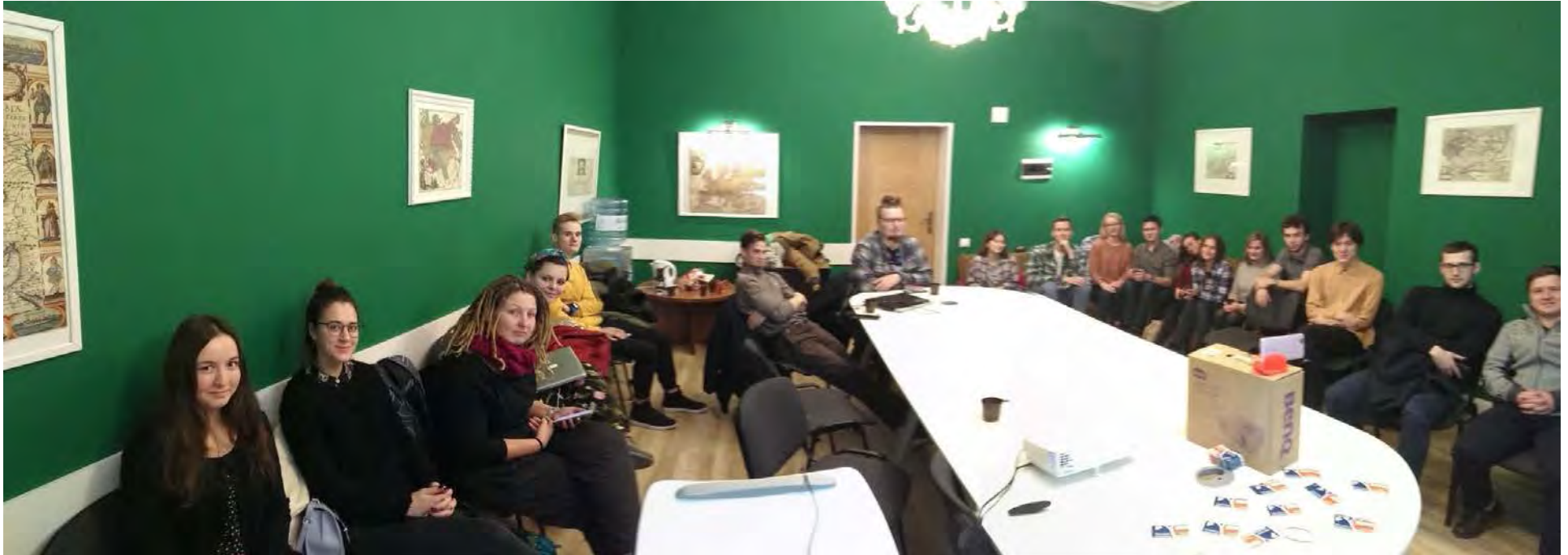
Group picture of PYRN Russia members and attendees of PYRN Meeting

showed bright photos and told unforgettable stories about the places they visited, the people they met, and the research they conducted. There were six talks from a wide variety of places from Svalbard to Alaska, from Yamal to Chukotka and more! Live translation of PYRN Meeting was organized via official PYRN Instagram page (@pyrn_official) that allowed 10-15 more people to join us virtually and to hear young researcher talks. During the coffee break, PYRN stickers were distributed among the attendees to identify themselves as a part of our community!