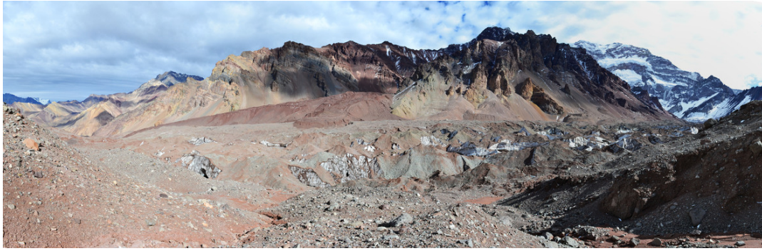
Argentine Central Andes (Photographer Gilen Anetas, 2014)