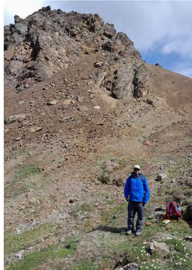
PYRN member Kaytan Kelkar conducting reconnaissance for mountain permafrost monitoring sites in Denali National Park, Alaska, USA.