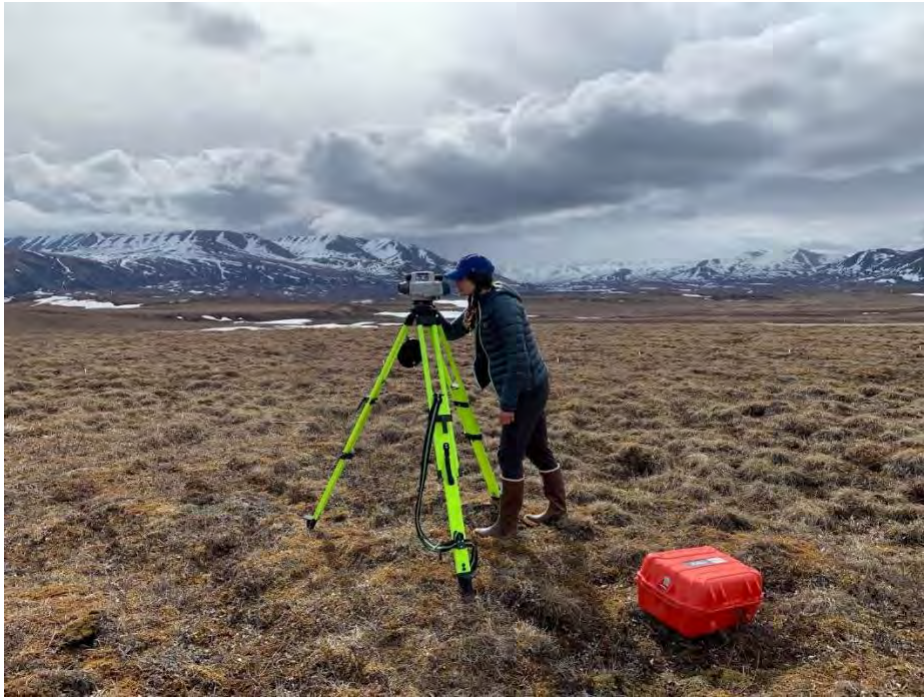
PYRN Member collecting elevation data for mapping the seasonal settlement on the North Slope, Alaska, USA.