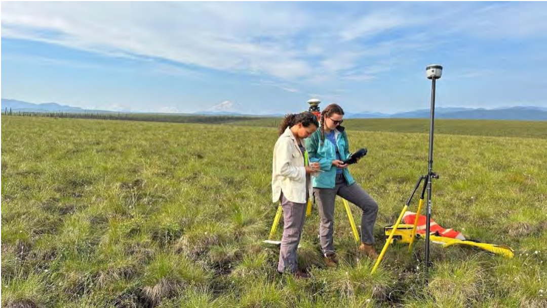
PYRN members Emma Lathrop and Allison Kelley measuring ground surface change along thermokarst transects in Denali National Park, Alaska, USA.

PYRN members conduct fieldwork in some of the most beautiful locations! From the Arctic to the Alps, here is a collection of fieldwork photos shared by PYRN members!